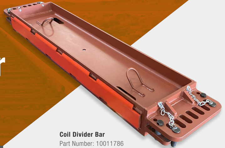
Coil Divider Bar Part Number: 10011786

Coil divider bars play a vital role in steel coil transportation by effectively distributing the load in your railcar and maintaining coil integrity.